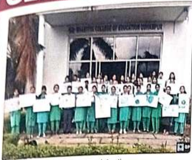
Earth Day celebration