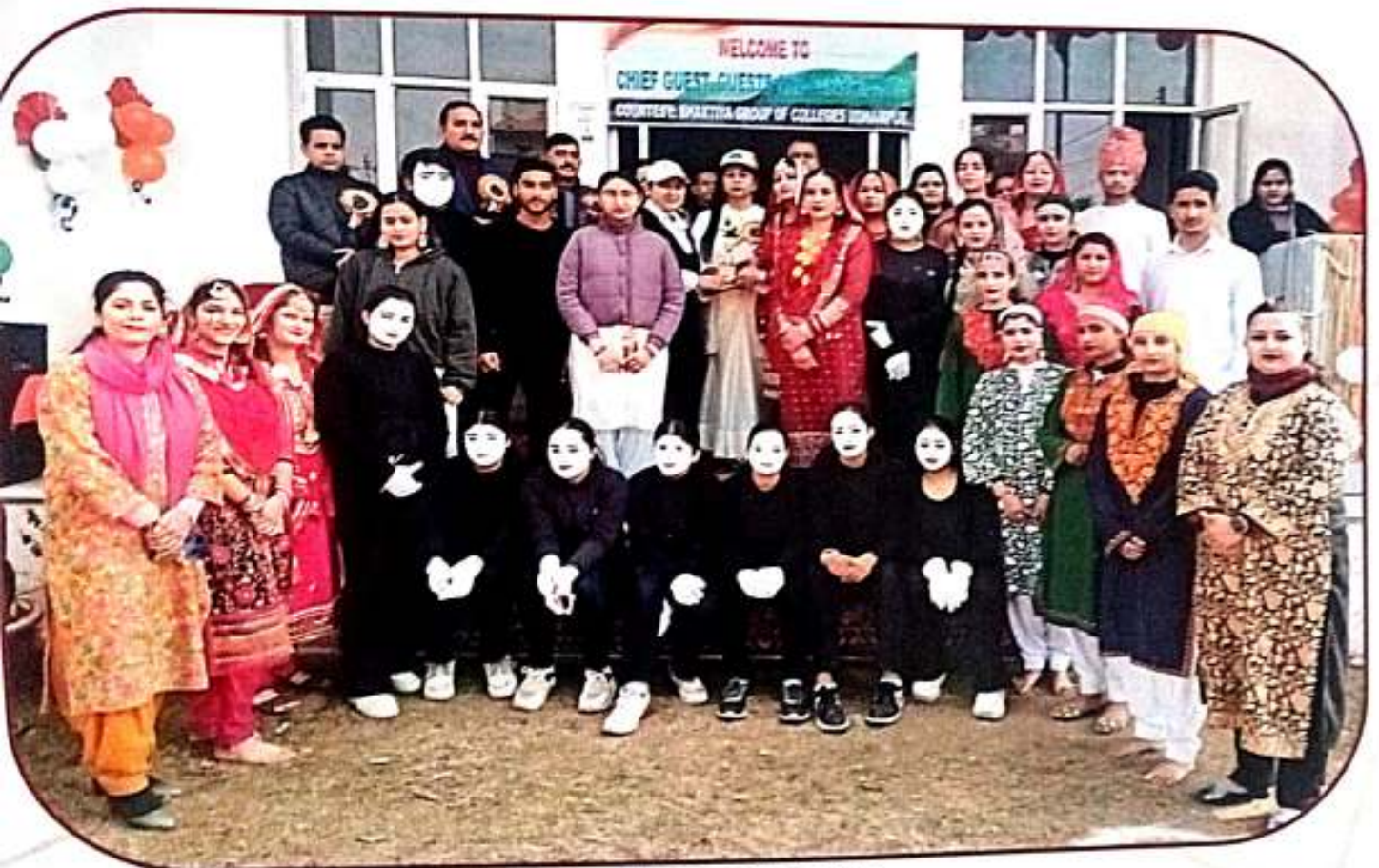
Republic Day Celebration