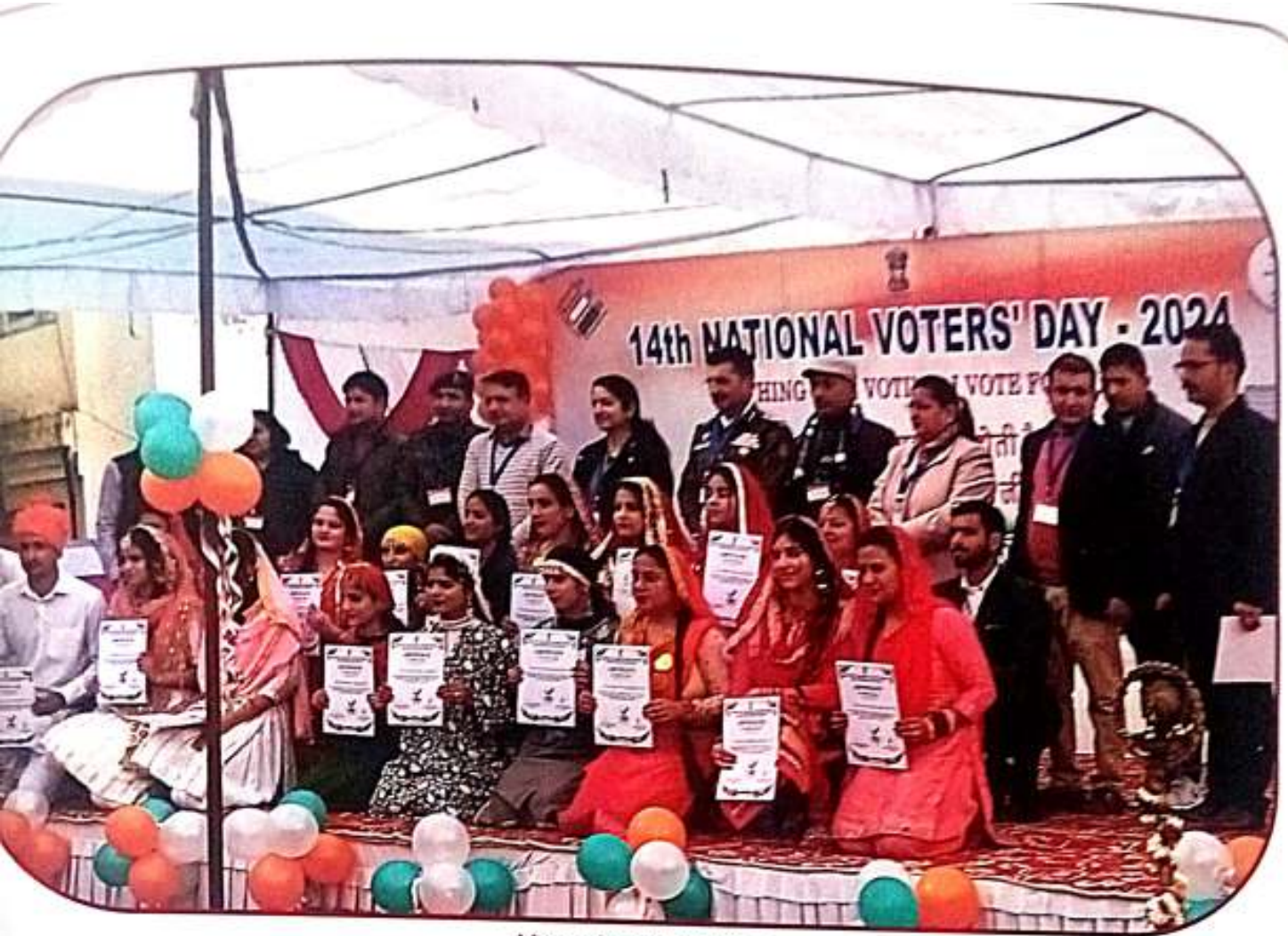
Voter Day Occasion